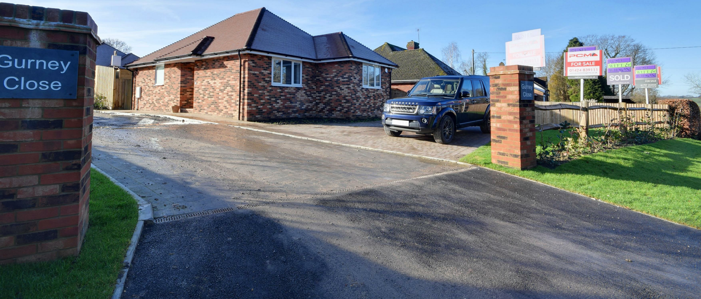
4 Gurney Close, Northiam Road, Broad Oak, East Sussex, TN31 6EP. £399,950 Freehold